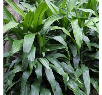
Dracaena 'Janet Craig'