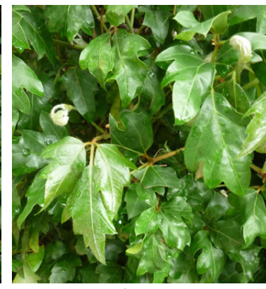
Cissus rhombifolia (climber)