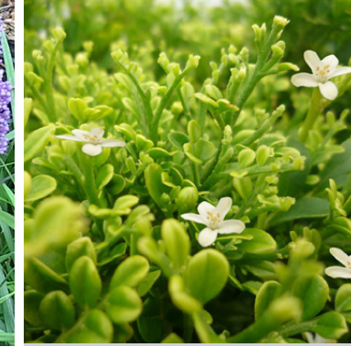
Murraya 'Min a Min'