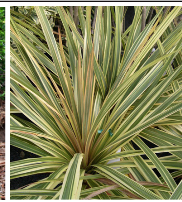
Cordyline 'Torbay Dazzler'